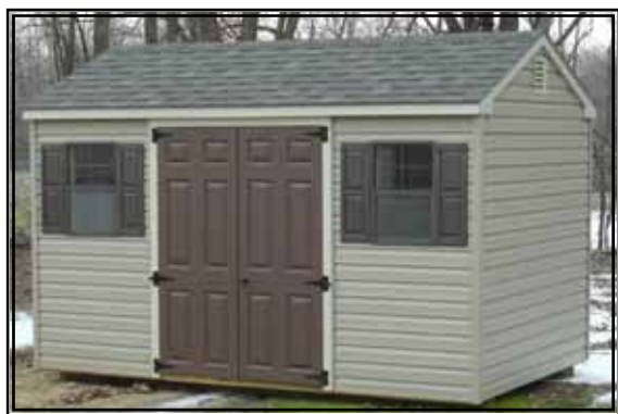
Doors and windows can be placed anywhere on shed