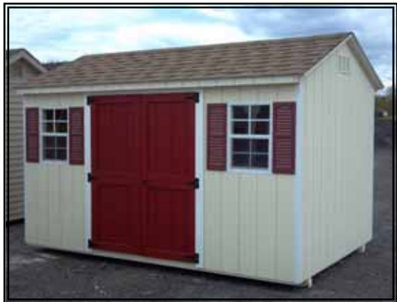
Doors & Windows can be placed anywhere on shed