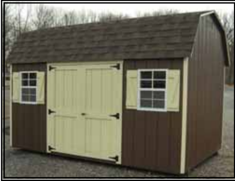
Doors & Windows can be placed anywhere on shed