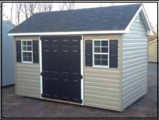
Doors & Windows can be placed anywhere on shed