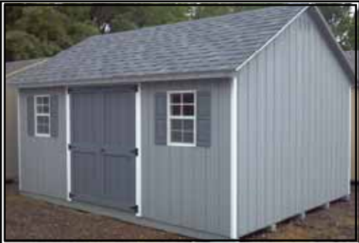
Doors & Windows can be placed anywhere on shed