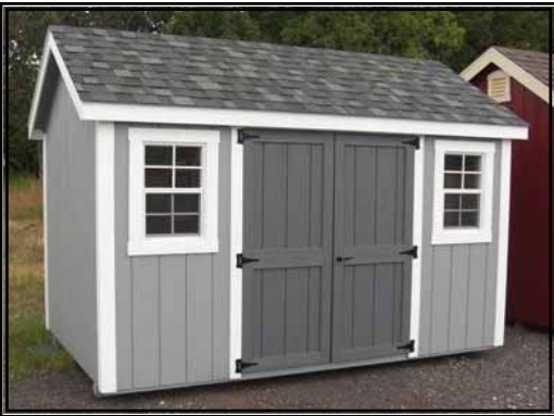
Doors & Windows can be placed anywhere on shed