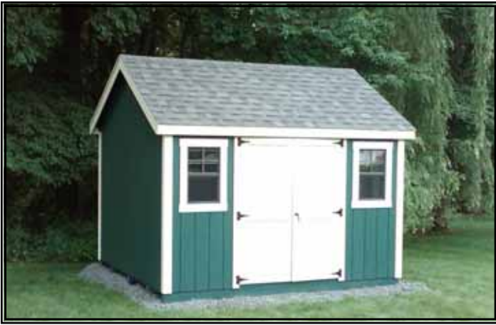
Standard Crushed Stone Pad