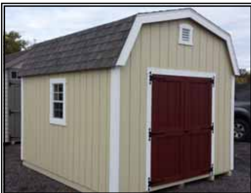
Doors & Windows can be placed anywhere on shed