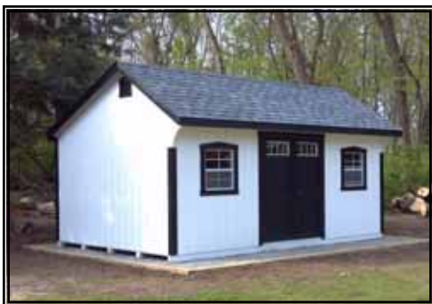
*Optional Transom Windows Shown*