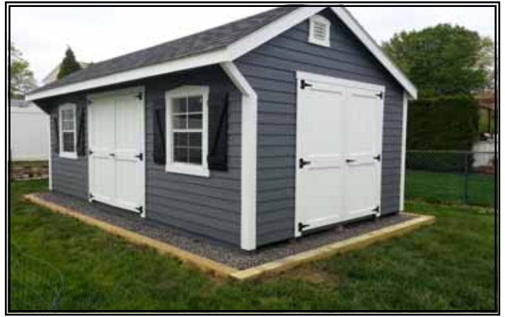
Crushed Stone pad with 1 Layer 6x6 perimeter