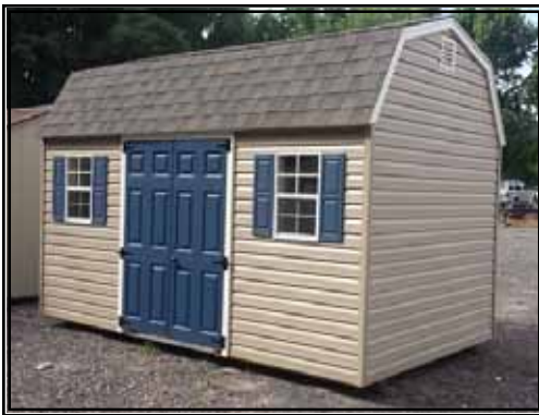
Doors & Windows can be placed anywhere on shed