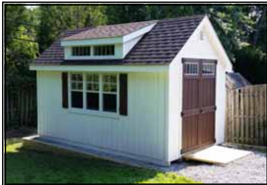
Shown w/ optional transom windows in doors